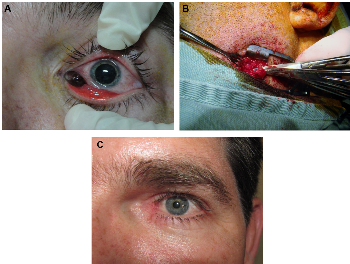
Figure 2 Conjunctival melanoma before and after excision (case 3). (A) Excision of the lesion. (B) Identification of the submandibular lymph node. (C) Postoperative result.

metastatic disease, this is followed by immunohistochemistry analysis using three glycoproteins, ie, S-100, Melan-A, and HMB-45 antigen, for more accurate results. Patients with metastatic SLN are offered radical lymphadenectomy of the metastatic lymph node chain as a standard procedure. For patients with advanced regional disease, ie, N2 or N3, we discuss adjuvant radiotherapy.