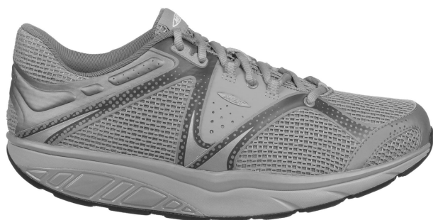
Figure 1 Illustration of the MBT shoe used in the study. Abbreviation: MBT, Masai Barefoot Technology.

The subject's degree of muscle fatigue was expressed on a 12 cm visual analog scale (VAS) 16 where 0 cm indicated 'comfortable with no fatigue' and 12 cm represented 'too exhausted to do anything'. Each participant answered the questionnaires five times in total. On the day of the marathon, the participants answered the questions before the race (Pre) and immediately after finishing the race (Post). For the following 3 days, the questionnaires were completed in the morning. In addition to the estimates of fatigue, race performance (derived from the official records of the race), total walking time for the assigned condition, and length of time spent wearing the assigned shoes (we did not get this information for the CON group, because the subjects of the CON group did not have to wear shoes) during each day (except day 3) were reported.