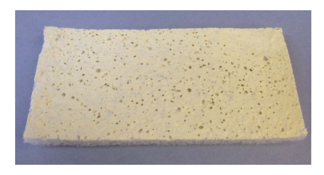
Figure I TachoSil fibrin sealant patch with active yellow side facing upwards.

Its safety profile is related to the use of pooled human plasma-derived fibrinogen and thrombin as well as equine collagen.<sup>7,20</sup> The pooled plasma may be associated with blood-borne disease transmission of viruses and prions.<sup>20</sup> Thus, there is a potential risk of HIV, hepatitis A, parvovirus B19, and Creutzfeldt-Jakob disease (CJD) transmission.<sup>7</sup> Efforts to minimize these risks include donor screening for a high-risk history, serologic and polymerase chain reaction testing, and antiviral processing such as pasteurization, precipitation, adsorption, pH, and gamma irradiation.<sup>7</sup> There is also a risk of allergic reaction and anaphylaxis in patients sensitive to human or horse proteins, as well as the risk of thromboembolism.7 The patch should not be used intravascularly, in the renal pelvis or near the ureter, in between the edges of the skin, in neurosurgery, in closed or infected spaces, or in treating severe or brisk arterial bleeding.7 In addition, overpacking of patches should be avoided.7 Migration of the patch inside the body is possible.7 Exposure of the patch to alcohol, iodine, or heavy metals can inactivate the patch.7 There are limitations on the number of patches that should be used in a patient depending on