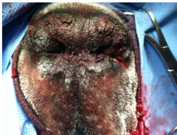
Figure 2 Postoperative view of the nasal philtrum in our patient.

The topical tacrolimus was discontinued for 1 week and the prednisone was decreased to 0.25 mg/kg PO every 12 hours due to adverse clinical signs including polydipsia, polyuria, and muscle wasting. An Elizabethan collar was used to prevent self-trauma to the surgery site.