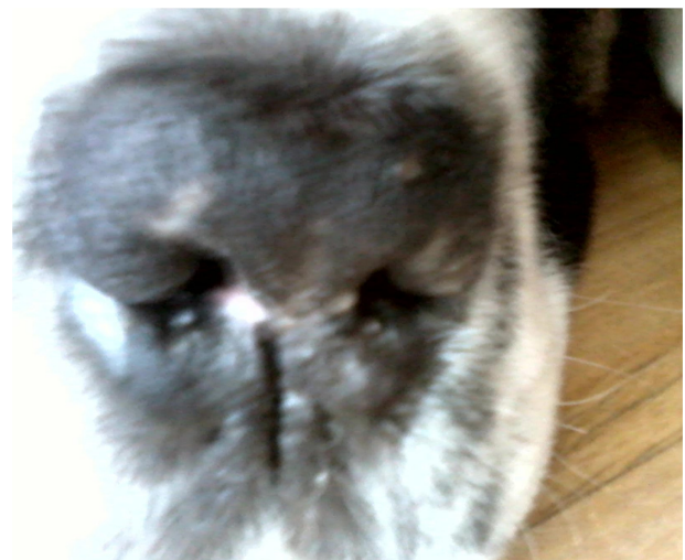
Figure 4 The nasal philtrum 3 months postoperatively in our patient.

Notes: No hemorrhage has been noted since surgery. Depigmented scar tissue.