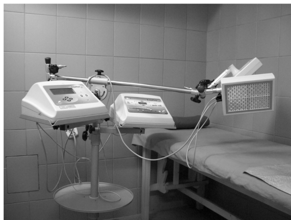
Figure 2 Apparatus Viofor JPS Standard to magnetoledtherapy procedures.

The magnetic field intensity amounted to 6. The procedures were performed in outpatient mode, two times a day, daily, for 3 weeks. After each procedure, the wound was dressed in a protective dressing.