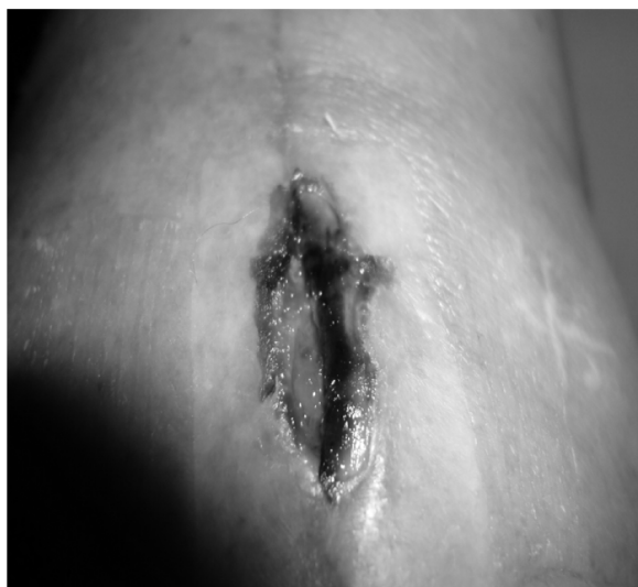
Figure 1 Photograph taken before starting the therapy.

On admission, the patient was found to have a wound in a persistent inflammatory condition and with pus secretion (Figure 1). Also on admission, in addition to the