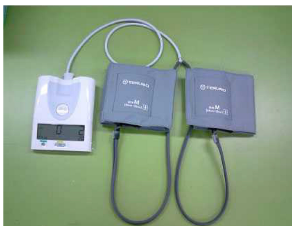
Figure 1 Our custom-made RIC device, showing the body of the system (left) and 2 blood-pressure cuffs connected to the system (right).

TTDE examination was performed using Vivid 7 (GE Healthcare UK Ltd, Little Chalfont, UK) in the standard manner. 19 LV end-diastolic and systolic volumes were obtained using the Simpson’s method and indexed by body surface area. LVEF was then calculated. Pulsed-wave Doppler examination of mitral inflow was performed to measure peak