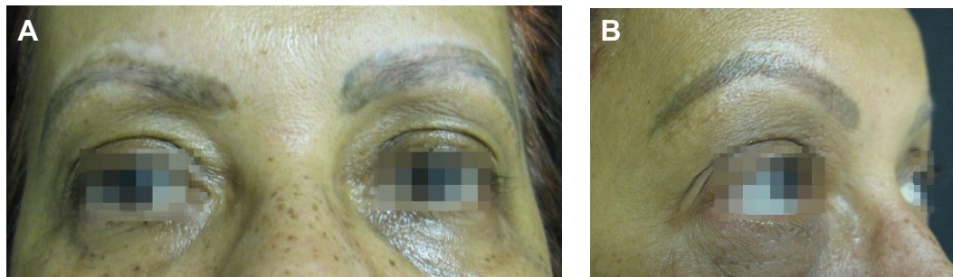
Figure 3 Patient 2.

Notes: Aspect before treatment. (A) Frontal view, (B) lateral view.