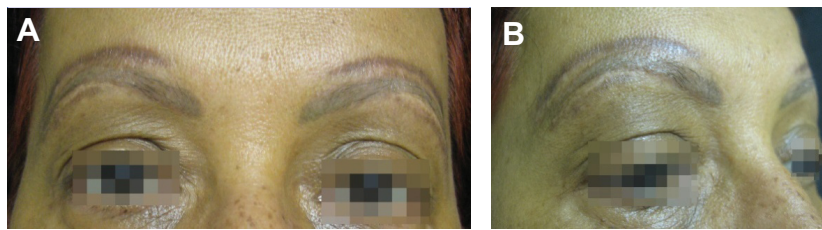
Figure 2 Patient 2.

Notes: Aspect before treatment. (A) Frontal view, (B) lateral view.