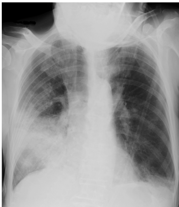
Figure 1 Chest radiograph on day of admission.

On the following day, his respiratory function deteriorated. He was intubated and placed on mechanical ventilation