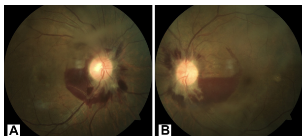
Figure 2 Fundus examination of both eyes showing spontaneous partially resolved hemorrhage after 6 weeks.