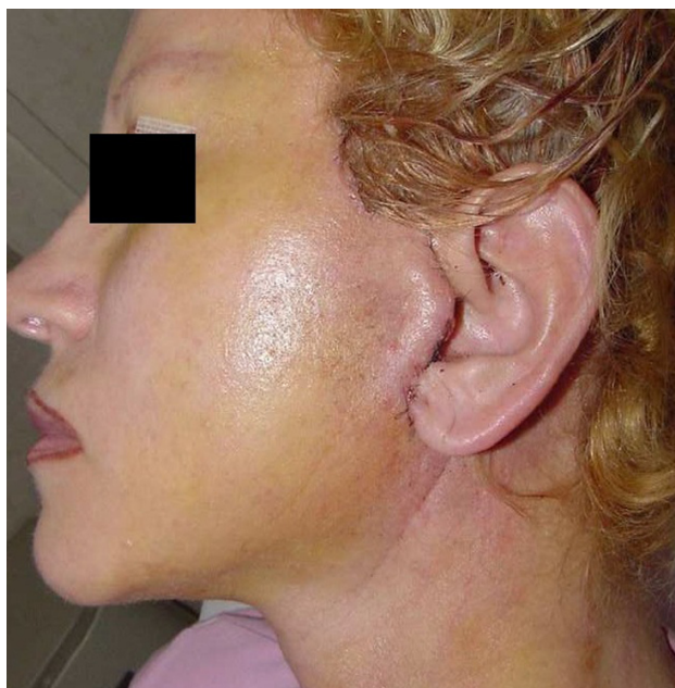
Figure 6 Appearance 3 days postoperatively after removal of eyelid sutures.