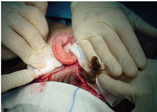
Figure 3 Excess glue is squeezed out from the dissected area through the skin incision and eliminated.

( P=0.357 , paired t -test). No cases of seroma or induration were observed, with only one bilateral case of slight ecchymosis and another bilateral case of moderate edema (more than the light usual one). The results are shown in Figures 6–9.