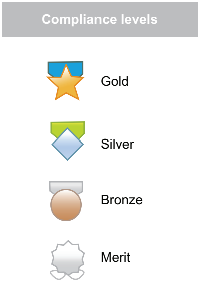
Figure 1 Nanomaterial Registry compliance medals in decreasing order of compliance score range: gold, silver, bronze, and merit.

Abbreviation: DOI, digital object identifier.