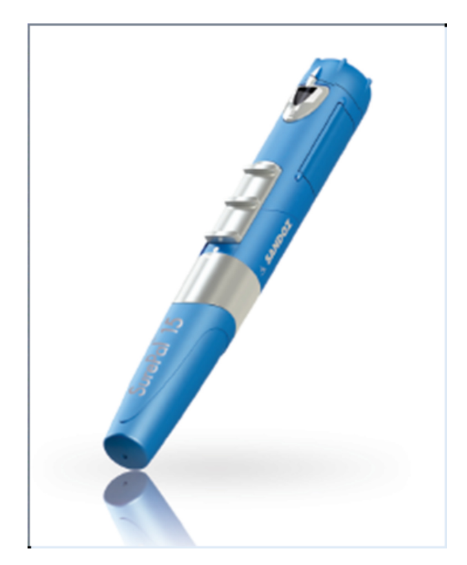
Figure I The pen device.

The pen evaluated in the study was a multidose, semireusable needle-based injection system (Figure 1). This new