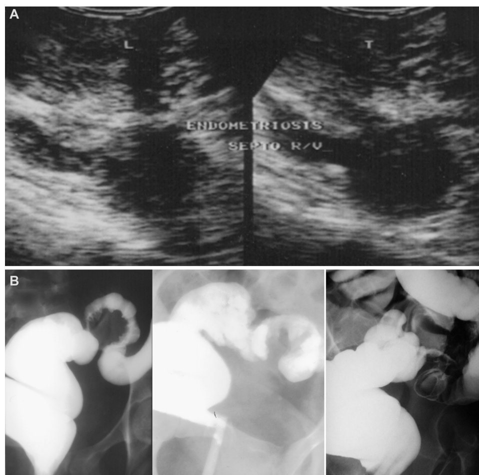
Figure 1 (A) Transvaginal ultrasound image showing endometriosis of the rectovaginal septum. (B) Radiologic images of a barium enema in patients with deep infiltrating endometriosis and intraluminal sigmoid tumor.

hormone replacement therapy, paying attention to symptoms, clinical examination, and tumor markers.