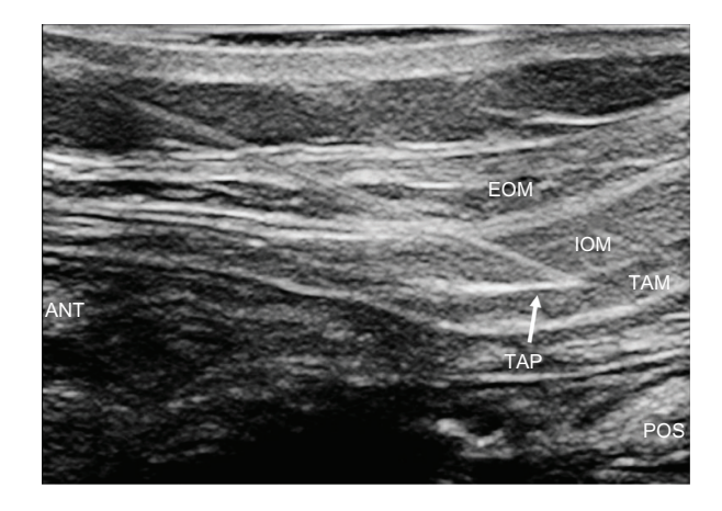
Figure I An ultrasound image of needle tip in the transversus abdominis plane (TAP) between the internal oblique muscle (IOM) and the transversus abdominis muscle (TAM) prior to injection. The external oblique muscle (EOM) is also well visualized.

Following the initial CT scan, the needle was left in place and extension tubing with a syringe containing the dilute iodinated contrast agent was connected to the needle. Maintenance of needle position in the TAP layer was verified