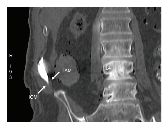
Figure 2 A coronal CT slice at the lumbar region demonstrating the spread of 5cc contrast material injected under ultrasound guidance into the transversus abdominis plane between the internal oblique muscle (IOM) and the transversus abdominis muscle (TAM).

As described in prior studies, there exists a difference in spread when a TAP block is performed under ultrasound guidance, versus a nonguided approach to the triangle of Petit.<sup>13</sup> We chose to perform the injection using ultrasound guidance, with the goal of accurately measuring injectate