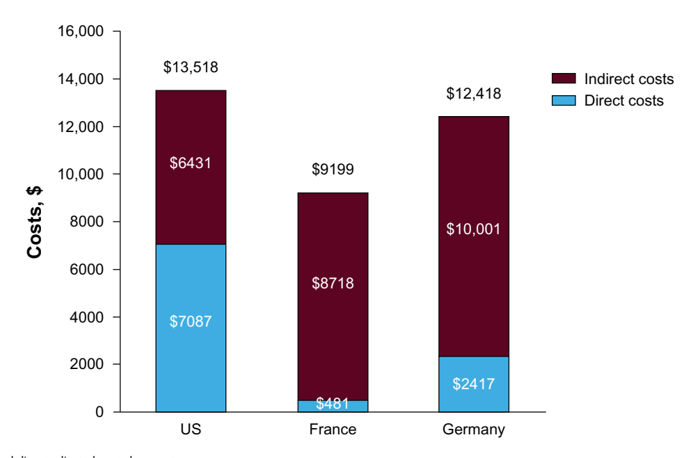
Figure 2 Indirect and direct adjusted costs by country. Notes: All values are in 2009 US dollars. Costs are adjusted by multivariate regression, controlling for: country, employment status, gender, age, number of comorbid conditions, time since fibromyalgia diagnosis, and FIQ severity level (mild, moderate, or severe).

with $9819 ($18,242) in France and $7898 ($15,822) in Germany (Table 4). Costs due to absenteeism were lowest in the US, with an unadjusted mean (SD) of $1228 ($4904), compared with $2407 ($9978) in France and $2300 ($7356) in Germany. Lost productivity mean (SD) costs due to disability were lower in Germany ($5598 [$14,904]) than in France ($7413 [$16,414]) and the US ($7333 [$15,833]). The US total disability cost included disability payments averaging $2137 ($4613) annually per subject.