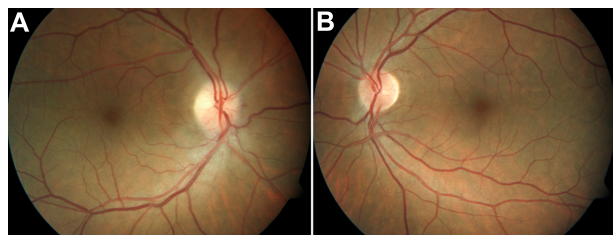
Figure 1 (A) Fundus photograph of the right eye shows swelling of the disc and disc rim hemorrhage (left). (B) Fundus photograph of the left eye shows a healthy appearing but crowded disc with a cup-to-disc ratio of 0.2 (right).

The injection of TA might have an effect on optic nerve circulation by the following possible mechanisms. First, the impaired optic nerve circulation is related to the inhibition of nitric oxide synthesis. Nitric oxide, known as a physiological vasodilator, is synthesized in vascular endothelial cells. Corticosteroids reduce its synthesis by altering the glucocorticoid receptor, which has been identified in endothelial cells. 8 Thus, impaired endothelium-dependent dilation may result in vasoconstriction of the arteries/arterioles that feed the optic nerve head, thus decreasing the optic nerve circulation. Second, an acute increase in vascular tone might be apparent. Corticosteroids raise the vascular tone by potentiating the effects of vasoconstrictor hormones and by acting directly on vascular smooth muscle cells. 9 Corticosteroids also enhance agonist-mediated pharmacomechanical coupling by increasing \text{Ca}^{2+} mobilization and \text{Ca}^{2+} sensitivity of myofilaments. 8 These vascular changes have been shown to develop within