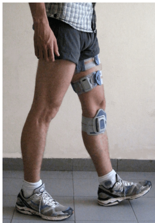
Figure 1 The Ness L300Plus system.

Gait velocity was assessed at baseline and after 6 weeks of conditioning by a qualified physical therapist as follows: immediately after fitting the dual-channel FES system and adjusting the electrode placement and stimulation parameters, each patient underwent gait evaluations with and without FES. This initial assessment (T1) was followed by a 6-week adaptation period during which participants increased their daily use of the system according to a fixed protocol, so that by the end of the fourth week, all subjects were able to use