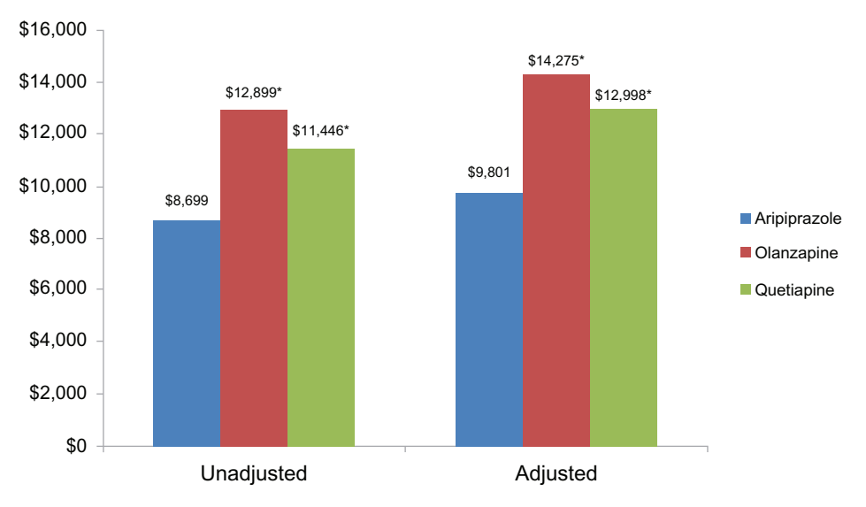
Figure 1 Twelve-month unadjusted and adjusted a total medical costs.

Notes: *Adjusted for age, sex, region, index year, preindex number of antidepressants, therapeutic dose range, PDG, MGH-AD, use of mood stabilizers, use of stimulants, use of thyroid, visit to a psychiatric provider, MDD code of 296.2x or 296.3x, diabetes, hyperlipidemia. *P < 0.05 for all comparisons with aripiprazole. Abbreviations: MDD, major depressive disorder; MGH-AD, Massachusetts General Hospital Scale – antidepressant version; PDG, psychiatric diagnosis group.