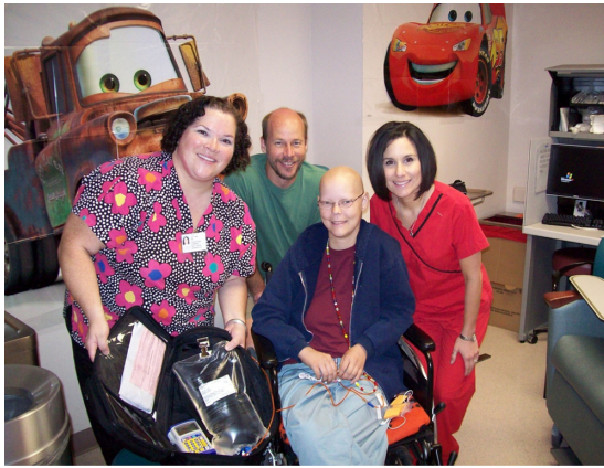
Figure 1 Outpatient osteosarcoma chemotherapy.

Notes: A portable pump + intravenous fluid bag + tubing are placed in a backpack. This allows complete outpatient protocols for provision of all cycles of chemotherapy using transdermal, intravenous, or oral antiemetics, the Gemstar® pump, and intravenous fluids.