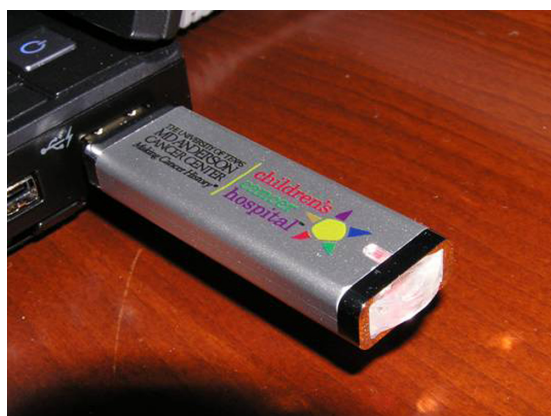
Figure 3 A 2 GB flash drive is provided to our adolescent and young adult patients with osteosarcoma.

New fellows receive a family-centered care orientation. When teaching residents or fellows in the outpatient clinic, there should be an attitude of facilitating the best possible care using the help and skills of the fellow or resident and