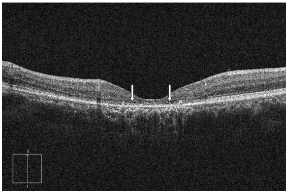
Figure 1 The optical coherence tomography of a patient with photoreceptor disruption demonstrated the discontinuity of the inner segment/outer segment line (arrows).

A total of 29 eyes from 29 patients (27 males and 2 females) were reviewed. The mean age was 46.2 years (range 33–62 years), and the mean duration of symptoms before treatment was 192 days (range 13–1097 days) (Tables 1 and 2). The mean durations of the disease in patients with and without photoreceptor disruption were 205 and 182 days ( P = 0.8 ) (Table 2). The mean logMAR BCVA scores of all the patients at baseline and 12 months were 0.34 (standard deviation [SD] \pm 0.30 ) and 0.14 (SD \pm 0.27 ), respectively. Twenty-seven patients experienced a BCVA improvement after PDT, whereas two patients showed stable BCVA. Regarding the primary outcome, photoreceptor disruption at the fovea was observed in 13 eyes (44.8%) 12 months after treatment.