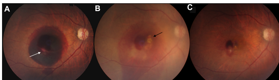
Figure 1 Case 1 fundus photograph of the right eye. (A) At the initial visit to the clinic, the fundus showed submacular hemorrhaging with retinal macroaneurysm in the center (arrow). (B) At 21 days after gas injection, displacement of the submacular hemorrhage was observed and the coagulum remained on the fovea (arrow). (C) At 2 months after gas injection, the submacular hemorrhage was almost totally absorbed when compared with the patient's first visit.

A 58-year-old man presented with blurred vision of his left eye with onset 7 days previously. Initial examination on October 27, 2011 measured a BCVA of 1.2 for the right eye and 0.3 for the left eye. Intraocular pressure was 12 mmHg for the right eye and 10 mmHg for the left eye. Anterior segment and ocular media appeared normal. Ophthalmoscopy revealed subretinal hemorrhage in the macular area and reddish-orange subretinal nodules corresponding to polypoidal choroidal vasculopathy (Figure 2A). Optical coherence tomography (RTvue-100®, Optovue, Freemont, CA) detected an increased retinal pigment epithelial layer. After obtaining informed consent, he underwent displacement of the subretinal hemorrhage as previously described. Intravitreal 100% sulfur hexafluoride (0.5 mL) gas injection was performed at 4 mm from the corneal limbus. Paracentesis was performed to adjust for the transient rise in intraocular pressure. He was asked to maintain a resting position in his home as described for case 1. Three days after gas injection, intraocular pressure was 10 mmHg. Ophthalmoscopy at 5 days after gas injection revealed displacement of hemorrhage downwards and absorbance of part of the submacular hemorrhage. A slight vitreous haze was observed (Figure 2B). Most of the displaced hemorrhage became coagulum. The BCVA of the left eye was 0.5. Indocyanine green angiography at 12 days