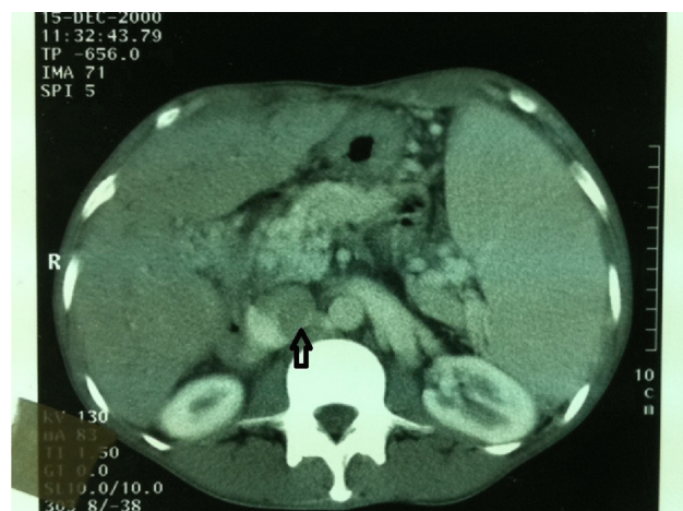
Figure 2 Contrast-enhanced computed tomography scan showing enlarged inferior vena cava with intraluminal clot (indicated by arrow), splenomegaly, and abnormally low enhancement of the liver.

On clinical examination, the patient looked frail and showed obvious signs of weight loss. His blood pressure was 120/80 mmHg. The most remarkable finding was a non-distended but diffusely tender abdomen. A complete blood count revealed leukocytosis at 12,300/ \mu L, predominantly with neutrophils; a hemoglobin level of 12 g/dL; and a normal platelet count. The patient's prothrombin time (PT) was 62%, with a prolonged kaolin-cephalin clotting time (KCT) of 41.5 seconds (control, 36 seconds); his blood sugar, blood urea nitrogen, and creatinine levels were all within normal limits. An abdominal computed tomography scan showed moderate dilatation of the inferior vena cava (IVC) with an intraluminal hypodensity consistent with venous thrombosis. The liver appeared hypodense compared with the spleen (Figure 2), with dilated intrahepatic veins that did not appear opacified, even in enhanced images (Figure 3), and there was homogenous splenomegaly. These findings were compatible with Budd-Chiari syndrome (BCS) secondary to IVC thrombosis. The patient was placed on a 10-day course of low-molecular-weight heparin, this in spite of the prolonged PT and KCT. Further anticoagulation was deemed risky because of the patient's irregularity in respect to follow-up appointments. He was therefore placed on low-dose aspirin and, as there was no local experience with transjugular intrahepatic portosystemic shunting, he was referred to a vascular surgeon in a hospital in Yaoundé, about 150 miles