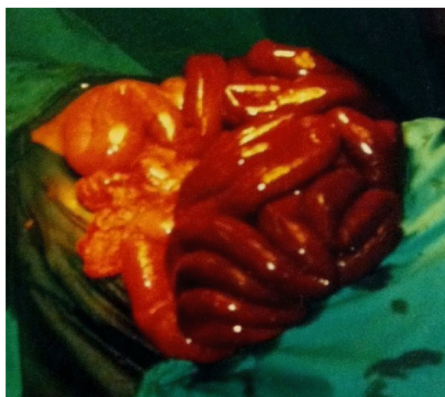
Figure 1 Hemorrhagic infarction of most of the small intestine, as seen at laparotomy.

A 43-year-old man presented with a history of fatigue, abdominal pain and discomfort, constipation, nausea, and vomiting of insidious onset over a 1-month period. A diagnosis of subacute intestinal obstruction was made and the patient was conservatively managed with regression of all other symptoms except abdominal pains, for which he was referred to the authors for further reassessment. The patient's family history was unremarkable, but his personal history showed that 6 years earlier he had undergone an intestinal resection with end-to-end anastomosis of his small intestine, indicated for infarction and gangrene of two-thirds of his small intestine (Figure 1). At that time, intestinal gangrene and infarction were thought to be secondary to mesenteric venous thrombosis, because onset was sudden and there was hemorrhagic infarction of the involved intestinal segment.