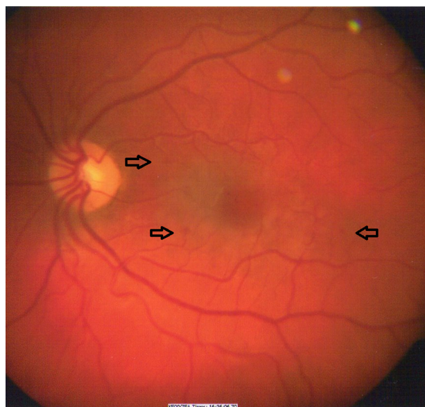
Figure 1 Left macula with dull foveal reflex and a few hemorrhages are indicated by arrows.

detachment (Figure 2). No abnormalities were detected in the right macula. Fundus fluorescein angiography (FFA) was undertaken, which showed the presence of hemorrhages in the left macula, without hyperfluorescence, leakage, or pooling.