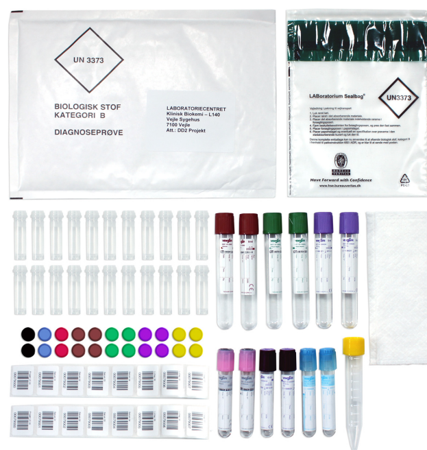
Figure 1 Complete sampling kit for The Danish Center for Strategic Research in Type II Diabetes.

A detailed description of sampling and handling was initially written and made available on the DD2 website. Later this was accompanied by video instructions for preparing the buffy coat. Following sampling and handling, the collected biological material is packed in certified packaging, contained in the kits, and mailed overnight to the biobank (see Figure 1). Most biochemical markers are stable for up to 30 hours. 9–11 At the biobank, samples are received and immediately stored at -80^{\circ}\text{C} in freestanding freezers. Currently, the laboratory centre at Vejle Hospital has employed a specialist in bioinformatics who is responsible for the biobank database administration and a biotechnologist who is responsible for all logistics. Similar activities have been established at the Danish National Biobank, including the establishment of a Danish National Biobank Registry ( http://www.nationalbiobank.dk ).