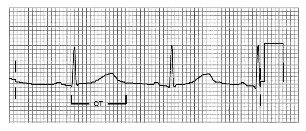
Figure I Schematic representation of the QT interval, which extends from the start of the QRS complex to the end of the T wave.

A number of generalized formulae attempt to limit the confounding effects of heart rate, eg, those of Bazett QTc (QTcB) = QT/(R-R)^{\frac{1}{2}} and Fridericia QTcF = QT/(R-R)^{\frac{1}{3}} . Some of the commonly applied formulae are presented in Table 1. These do not allow intraindividual differences to be taken into account, and are often unreliable at extremes of heart rate, particularly Bazett's formula. Moreover, the tendency for Bazett's formula to overcorrect QT for the effect of high heart rates often gives rise to apparent QT interval prolongation more than other formulae. Nonetheless, these formulae are often incorporated into electronic ECG recording devices so that QT and QTc data from automated analyses are readily available in clinical practice. Such automated methods normally incorporate a tangential measurement algorithm that may be unreliable for determining the T wave end, particularly where the T wave is of low amplitude. For the purposes of regulatory investigation, a thorough QT study