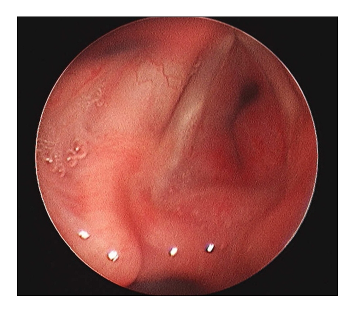
Figure 5 Bilateral subglottic hemangioma.

cutaneous hemangiomas (five or more) are at risk for hepatic hemangiomas and should have a liver-screening ultrasound to evaluate for liver IH. Few or multifocal liver hemangiomas are often asymptomatic, but they can sometimes cause high-output congestive heart failure. However, diffuse liver hemangiomas, a rare condition where the liver is almost replaced by hemangiomas, can result in life-threatening abdominal compartment syndrome and a severe form of hypothyroidism due to tumorrelated deiodination of the thyroid.<sup>45</sup>