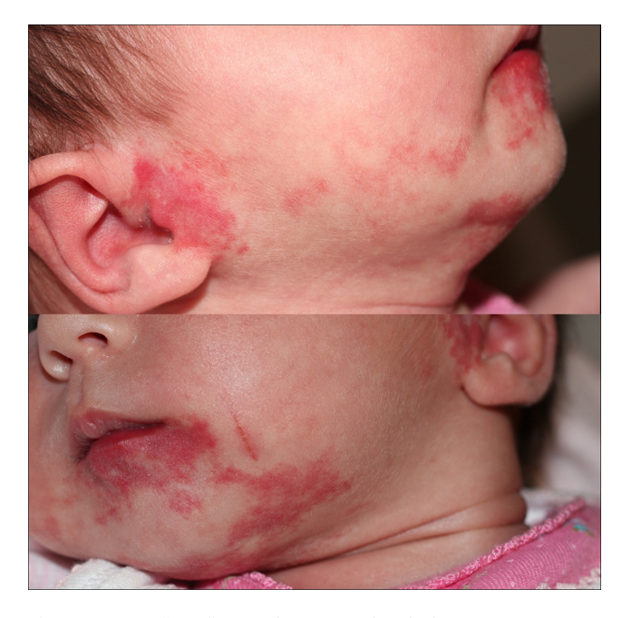
Figure 6 Bilateral "beard" IH in a 2-week-old infant. At 4 months, she presented with biphasic stridor and 90% occlusive airway IH. Abbreviation: IH, infantile hemangioma.

cutaneous hemangiomas (five or more) are at risk for hepatic hemangiomas and should have a liver-screening ultrasound to evaluate for liver IH. Few or multifocal liver hemangiomas are often asymptomatic, but they can sometimes cause high-output congestive heart failure. However, diffuse liver hemangiomas, a rare condition where the liver is almost replaced by hemangiomas, can result in life-threatening abdominal compartment syndrome and a severe form of hypothyroidism due to tumorrelated deiodination of the thyroid.<sup>45</sup>