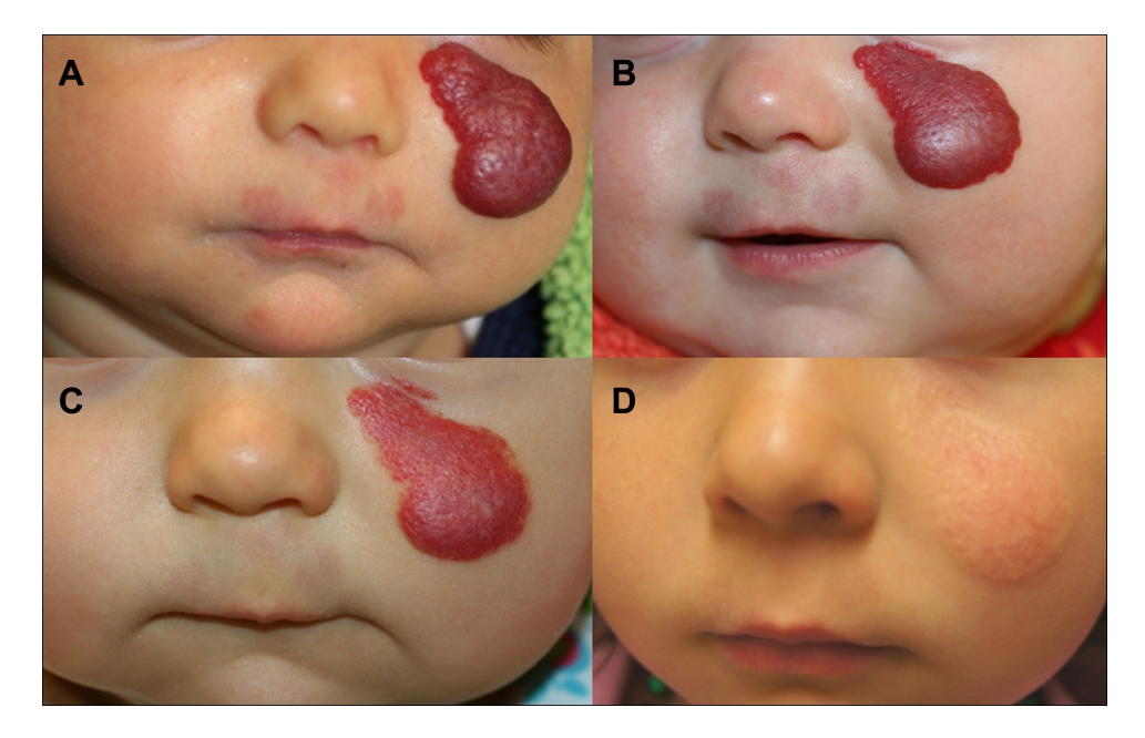
Figure 3 Thick superficial IH at (A) 3 months – proliferative phase; (B) 7 months; (C) 11 months – early involution; and (D) 2 years – after laser treatment demonstrating telangiectasias and subtle atrophoderma. Abbreviation: IH, infantile hemangioma.

In addition to disfigurement, periocular hemangiomas can lead to anisometropia and amblyopia, which, if untreated, can cause permanent visual loss.<sup>34,35</sup> Direct pressure on the cornea can produce astigmatism or myopia, and the mass effect of the tumor itself can cause ptosis, proptosis, visual axis occlusion, or strabismus. Segmental hemangiomas involving the preauricular, mandibular area, chin, and neck (the "beard area") have up to a 60% risk of having symptomatic airway hemangiomas, presenting with slow onset of biphasic stridor,