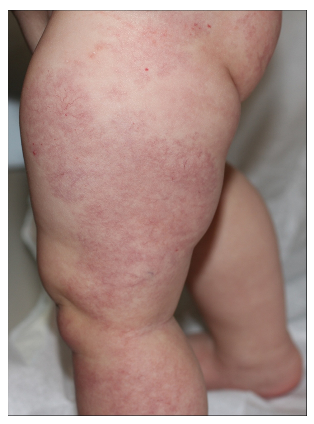
Figure 2 Minimally proliferative IH in a 1-year-old infant with a telangiectatic patch and small, bright red proliferative papules on the upper thigh and buttock.