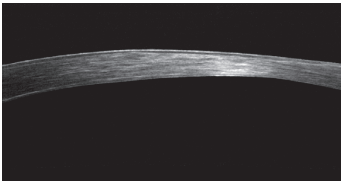
Figure 3 Picture showing the same portion of cornea as in Figure 2, in a cornea OCT 12 months following the treatment. The scar has been significantly reduced, the stromal surface smoothed, the epithelium has become more uniform in thickness, and the overall cornea thickness has been reduced.

CDVA was 20/100 both eyes (OU) with refraction: +4.00, -4.50 at 135 in the right eye (OD), +3.50, -1.00 at 55 in the