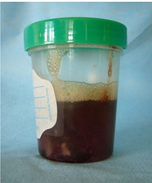
Figure 3 Hemoptysis contents with whitish material admixed on the sputum.

anticoagulated with warfarin for 6 months. Radiological resolution and spirometry normalization (Table 1) occurred after 4 weeks, whereas, elevated AST were normalized only after 8 weeks.